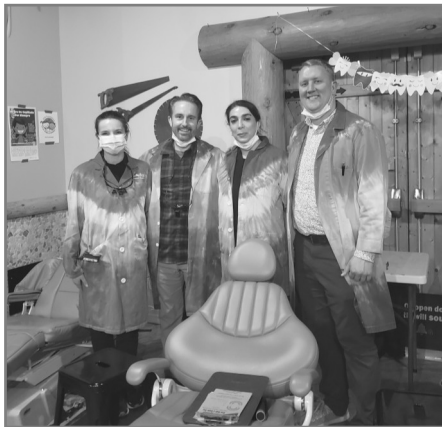
Toothapalooza Volunteers 2025