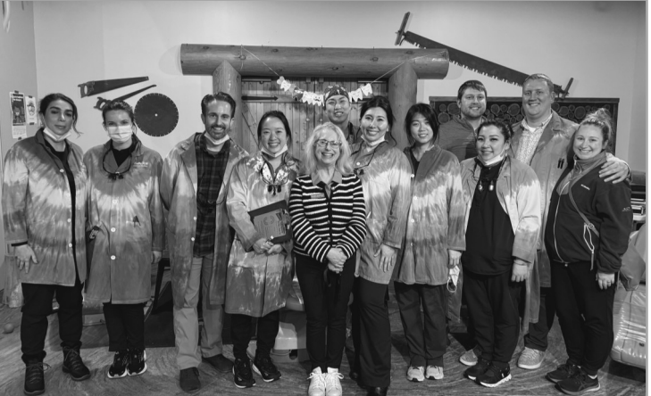
◀◀ Toothapalooza volunteers 2025 at ICM in Everett

Remember these great vendors when you are looking for business services and providers.