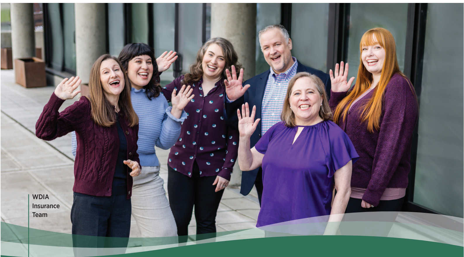
WDIA Insurance Team