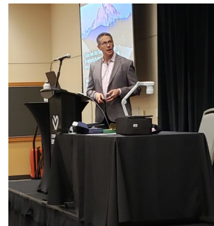
SCDS members attended Dental Action Day, in Olympia, in February. The Annual Seminar was held on March 7, at the Lynnwood Events Center.